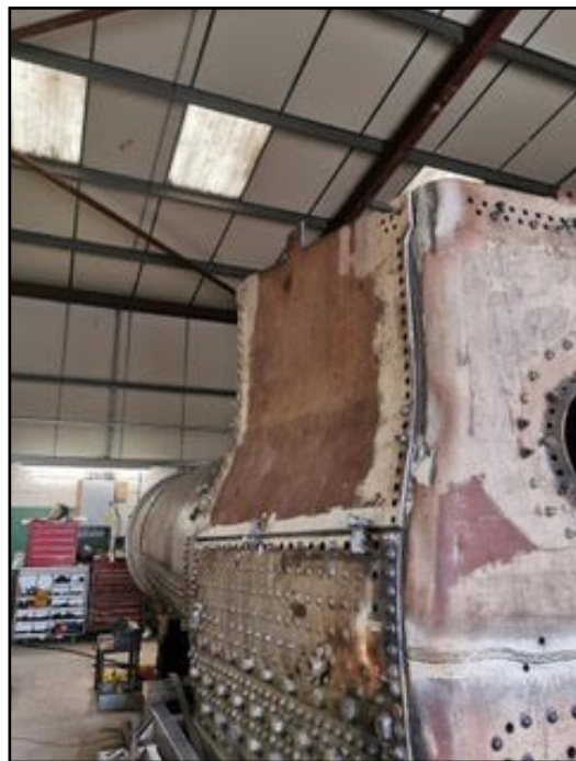
The boiler with holes now drilled, ready for the patch screws, rivets, and final welding.

Both side wrappers have been trimmed and fitted, with throat plate and backhead plate holes drilled and made ready to join the plates at either end. So called 'patch screws' will be necessary in some of these holes, combined with rivets, as there is limited access in the gap between the outer sheet and the inner firebox to use all rivets. Both plates have now been welded along their horizontal joining edge.