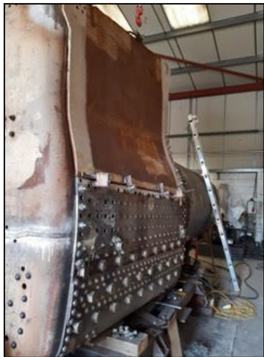
An earlier picture of the boiler side wrappers which have been cut, positioned and made ready for welding. The patch screw/rivet holes are still to be drilled on the vertical edges at either end.

We are pleased to report that major progress has been made by HBBS over the past few weeks since the last newsletter. Much work has been completed and things are really beginning to come together with our boiler.